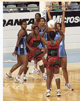
Malawi (red) playing Fiji (blue) at the 2006 Commonwealth Games