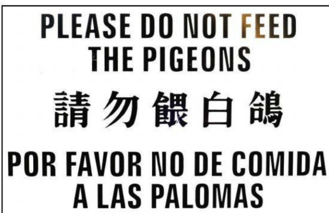
▲ FIGURE 5-2 THE WORLD'S THREE MOST WIDELY SPOKEN LANGUAGES (left) This sign in New York's Chinatown includes English, Mandarin, and Spanish. (right) Mandarin on an iPhone.

Many countries designate at least one language as their official language , which is the one used by the government for laws, reports, and public objects, such as road signs, money, and stamps. A country with more than one official language may require all public documents to be in all languages. Logically, an official language would be understood by most if not all of the country's citizens, but some countries